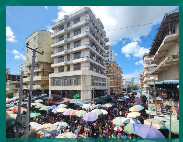
Figure 1 Kariakoo market, a densely populated trading area in Dar es Salaam, Tanzania.